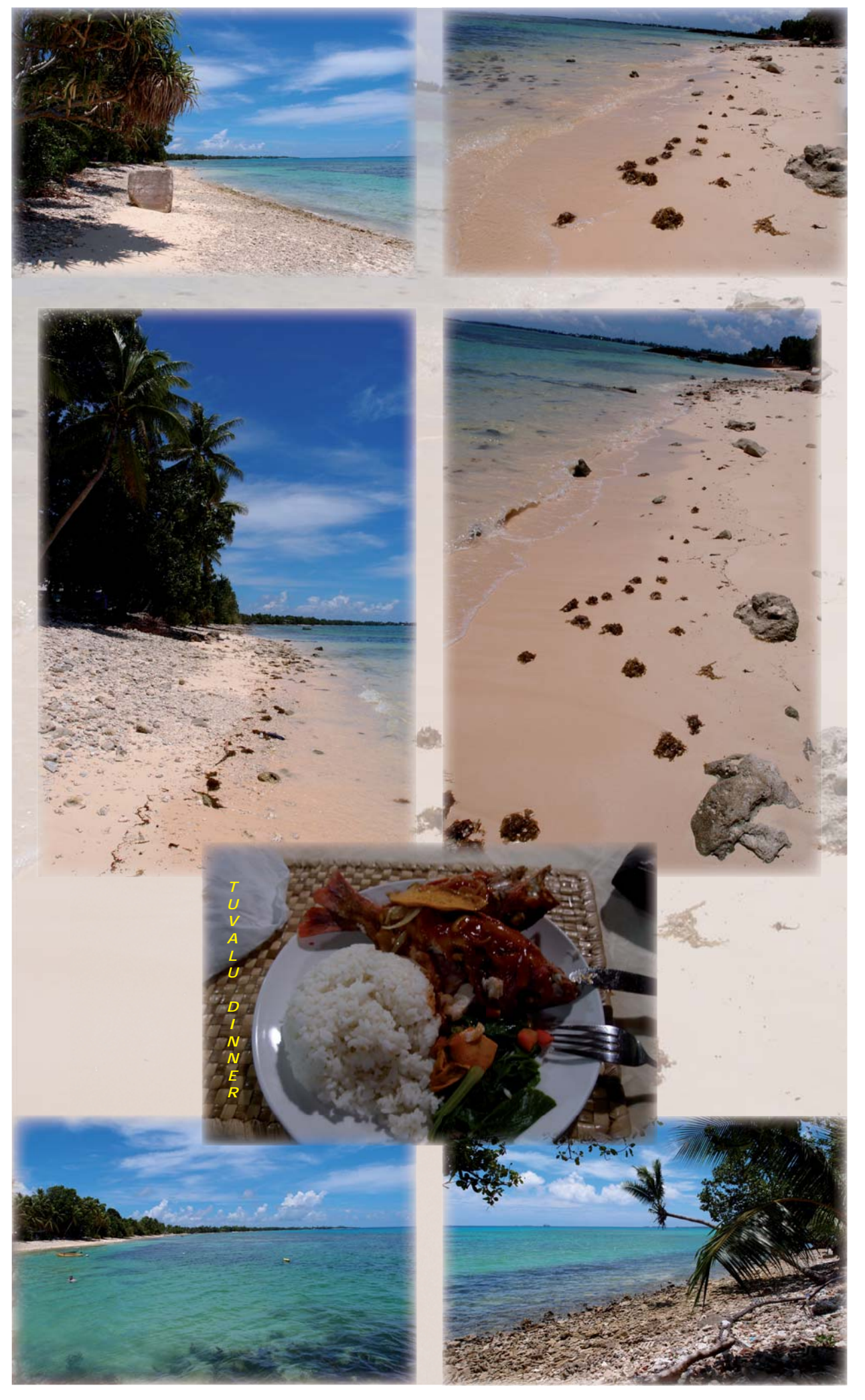
EUDXF newsletter MAY 2016