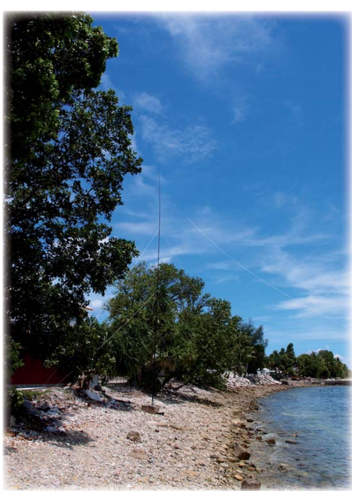
80 m/160 m vertical