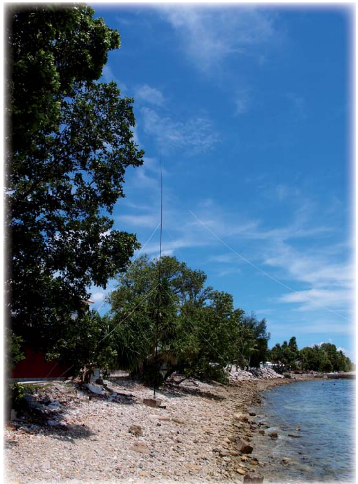
160 m vertical

700 m wires were cut out, soldered and transformed into antennas and radials. It was difficult, having in mind I did not have too much spare time. Sometimes, I did not have day off at work!