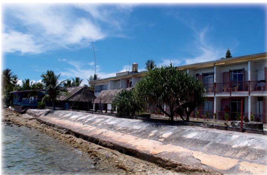
Exp. GP antenna