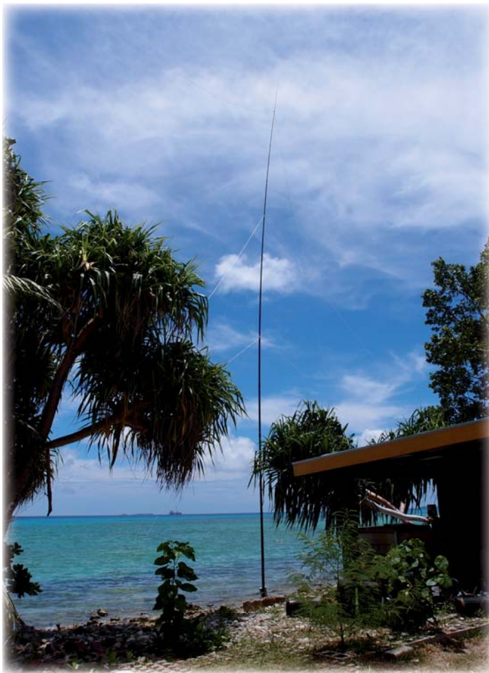
80 m/160 m vertical